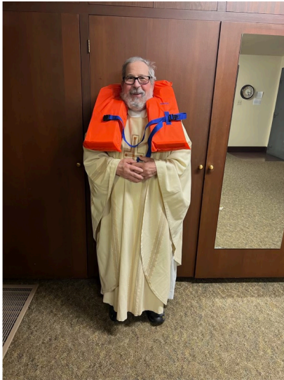
LIFE SAVING CLERGY

Clergy at local Sacramento church.